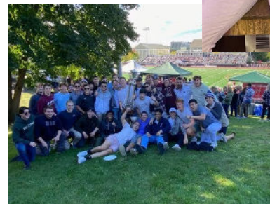
Brothers of Alpha Pi holding the Brown Cup.